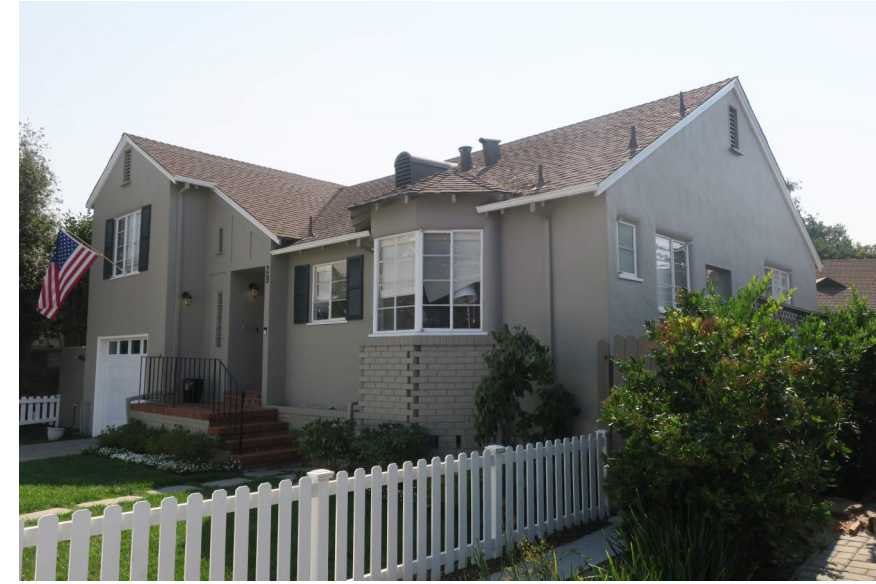
VIEW TO SOUTH TOWARD 29 BAYTREE