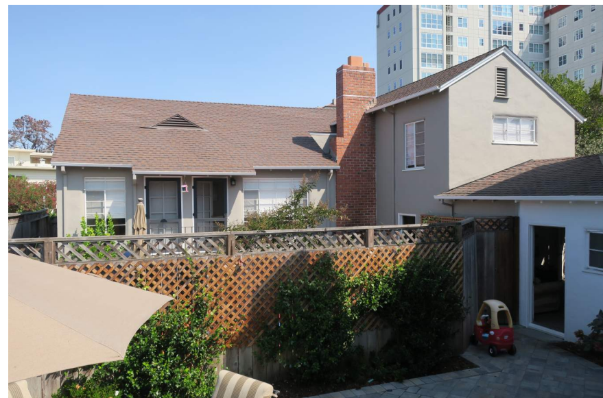
VIEW TO EAST TOWARD 29 BAYTREE