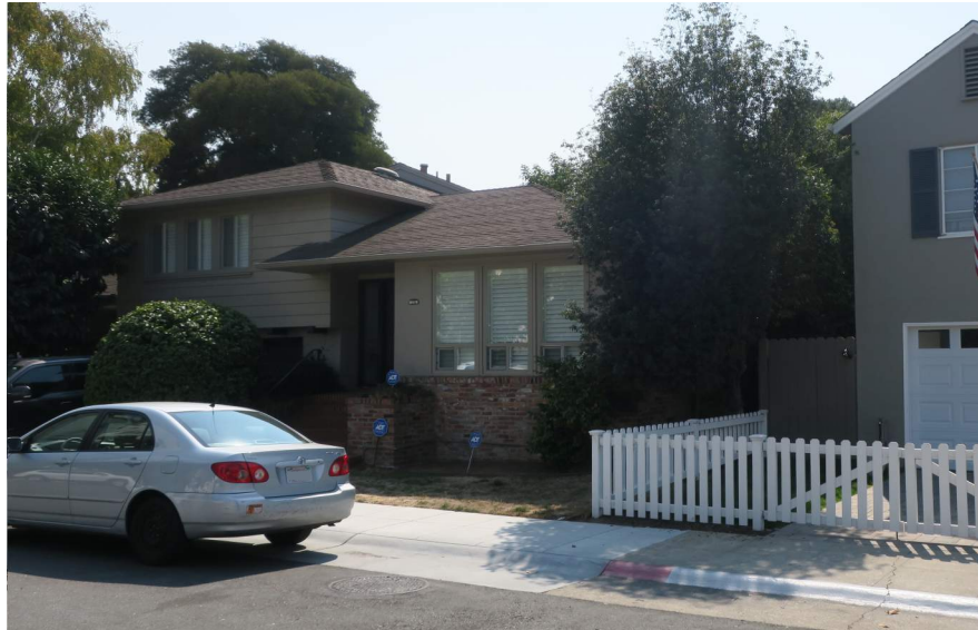
VIEW TO SOUTH TOWARD 25 BAYTREE AND 29 BAYTREE