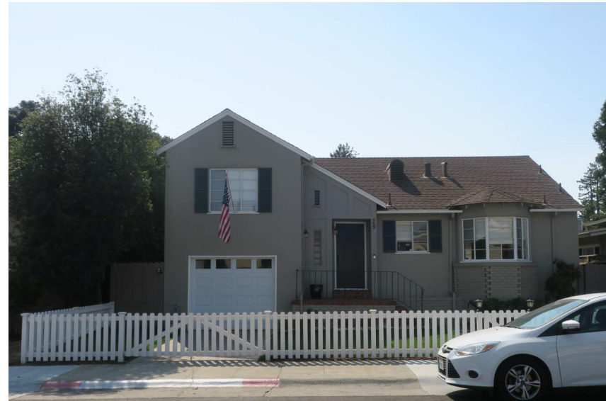
VIEW TO SOUTHWEST TOWARD 29 BAYTREE