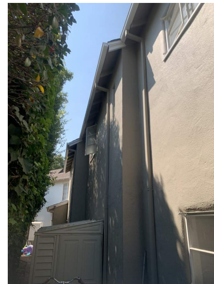
VIEW TO NORTHWEST 29 BAYTREE