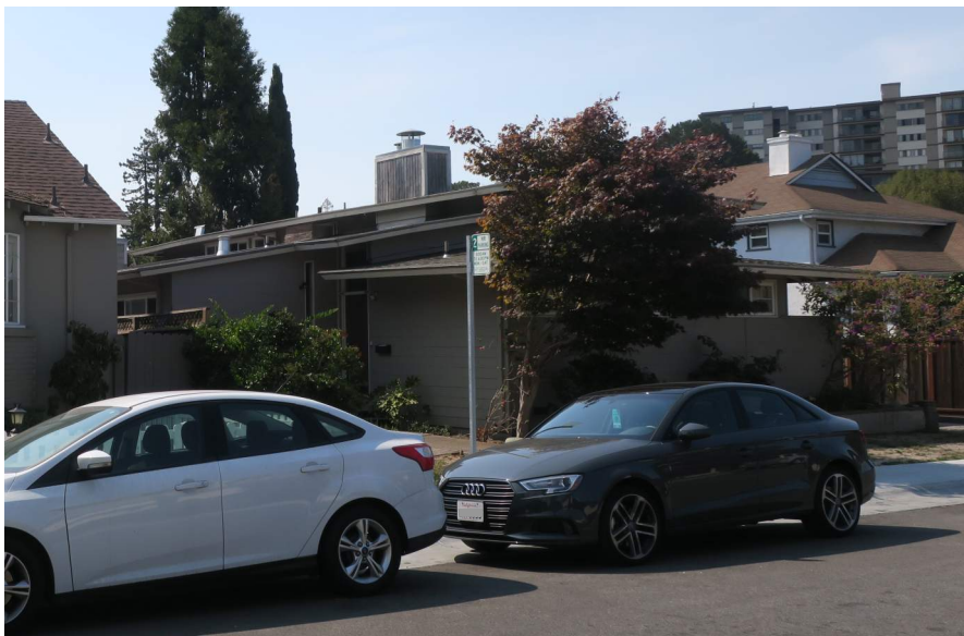
VIEW TO NORTHWEST TOWARD 33 BAYTREE AND 29 BAYTREE