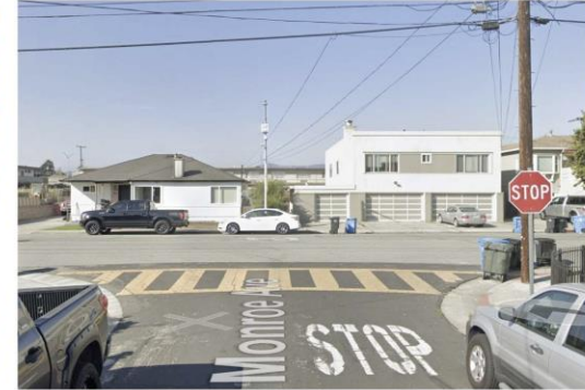
MONROE AVE LOOKS TOWARDS N.KINGSTON STREET 2