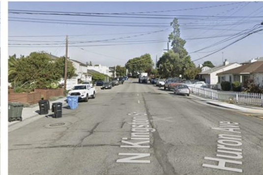
NORTH KINGSTON STREET FACING WEST 1