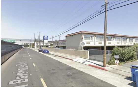
VIEW FROM N BAYSHORE BLVD 7