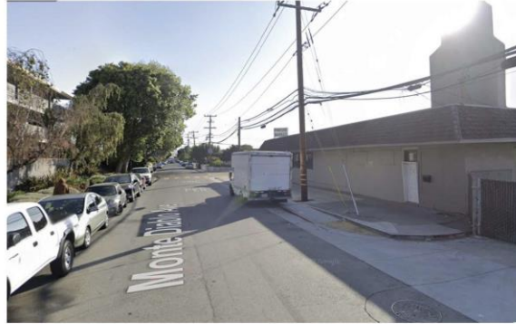
MONTE DIABLO AVE LOOKING NORTH 5