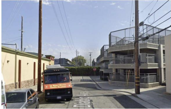
MONTE DIABLO AVE LOOKING TOWARDS SITE ACROSS HIGHWAY 101 8