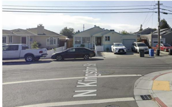
VIEW LOOKING TOWARDS MONTE DIABLO AVE 4