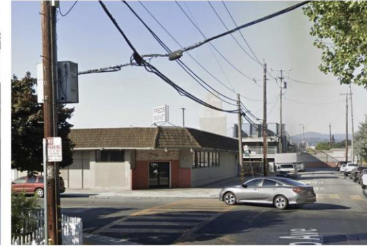
MONTE DIABLO AVENUE LOOKING AT SITE 3