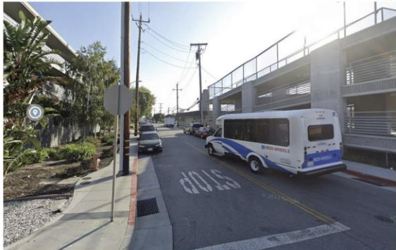
MONTE DIABLOE AVE LOOKING EAST 6